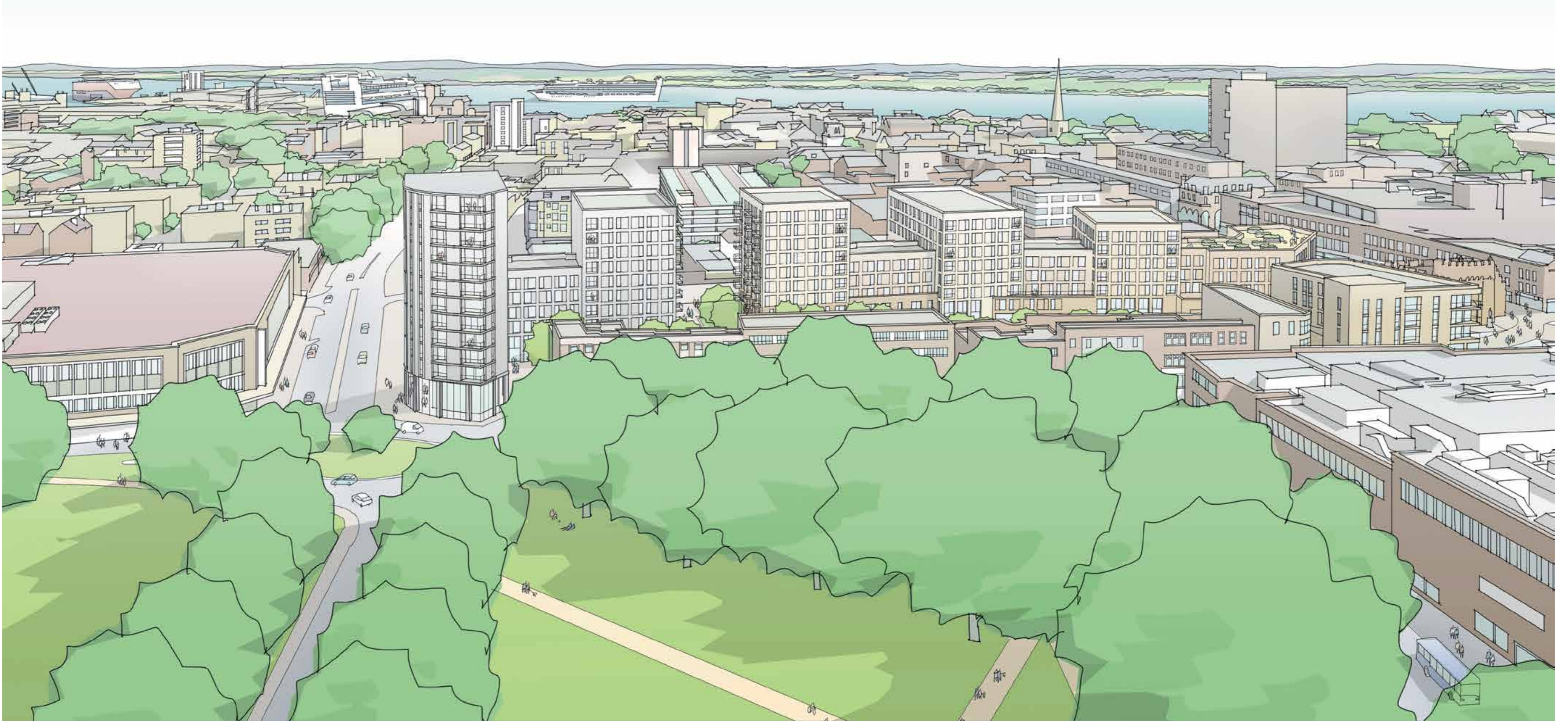
The Bargate Quarter viewed from the east of the site