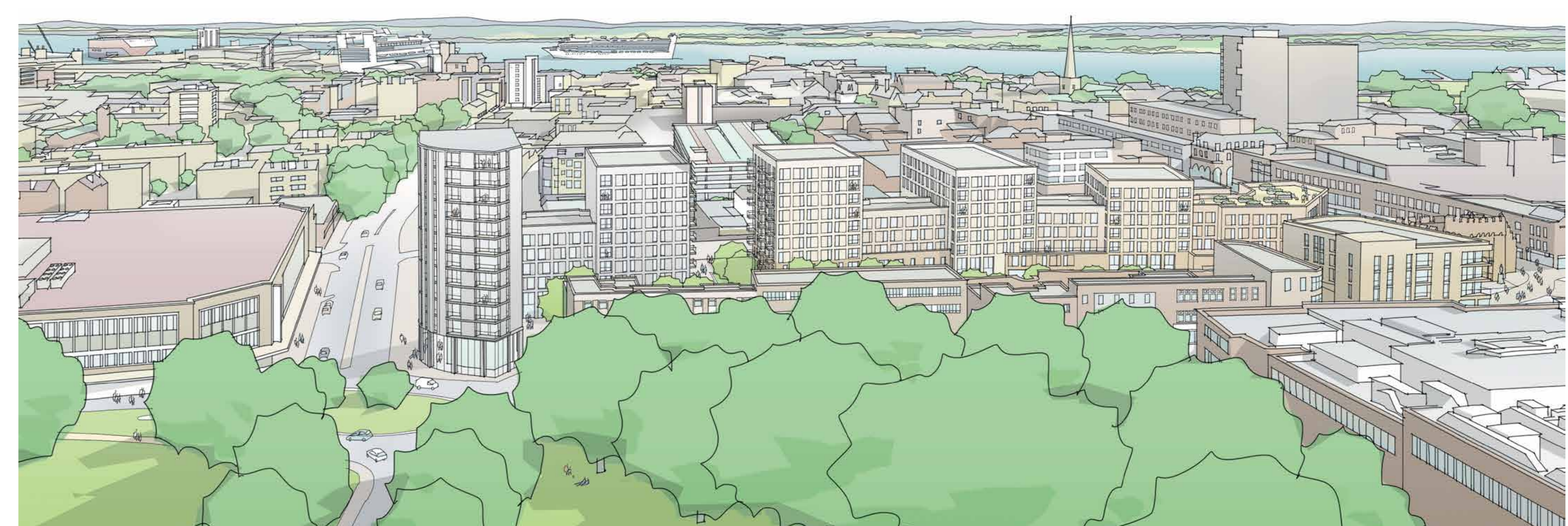
The Bargate Quarter viewed from the east of the site