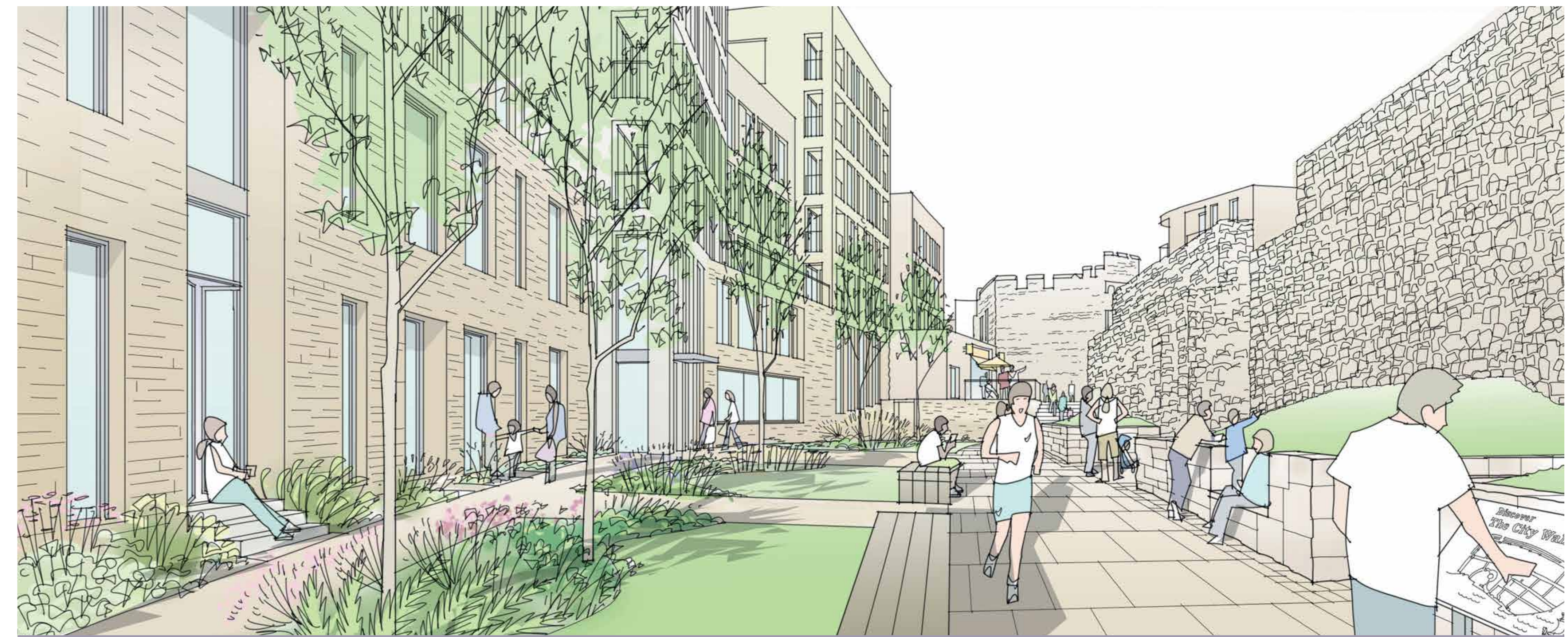
The Bargate Quarter scheme will seek to make much more of Southampton's historic City Walls and deliver high-quality public open spaces