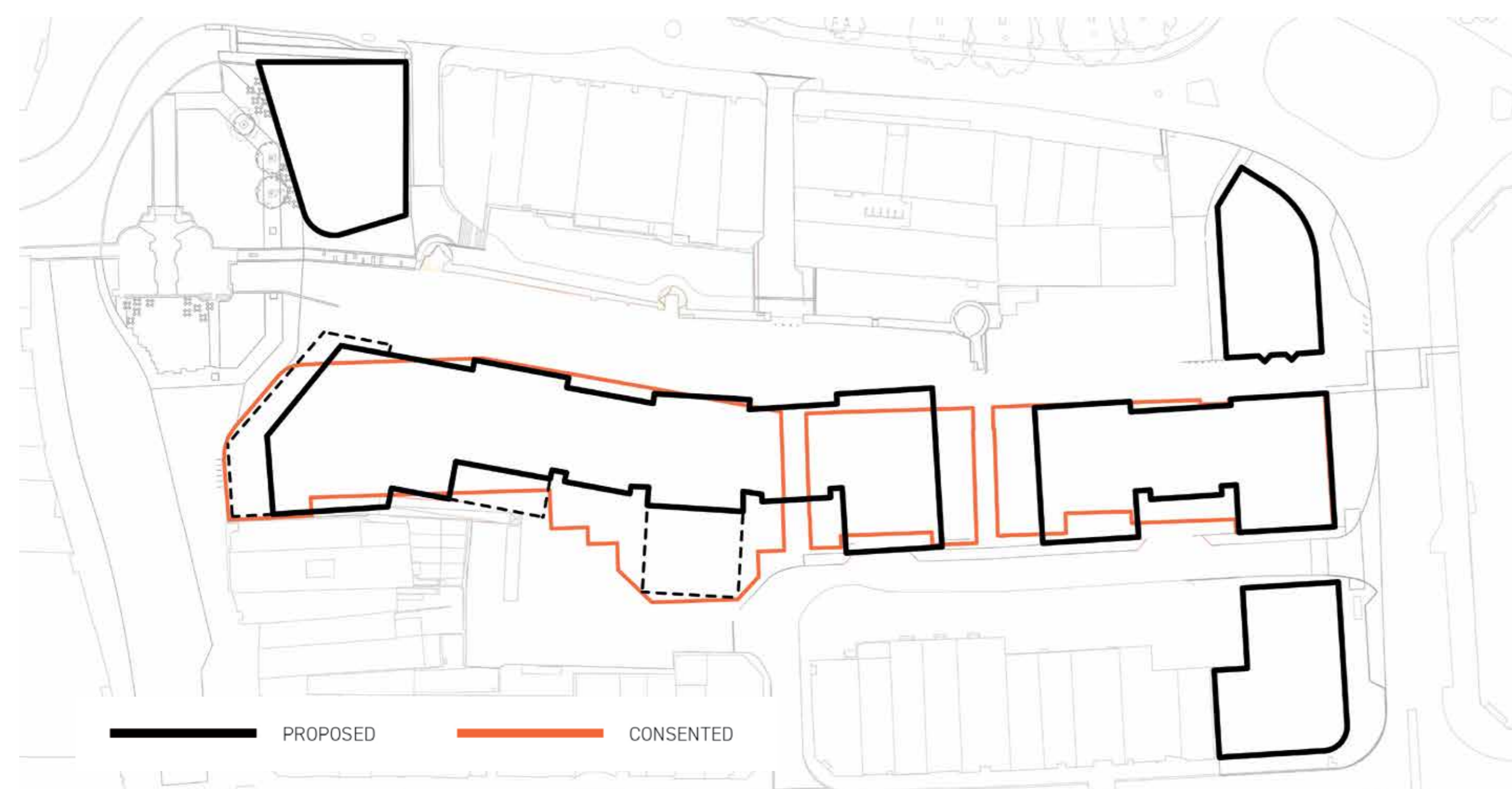
The footprint of the consented scheme along with the new vision