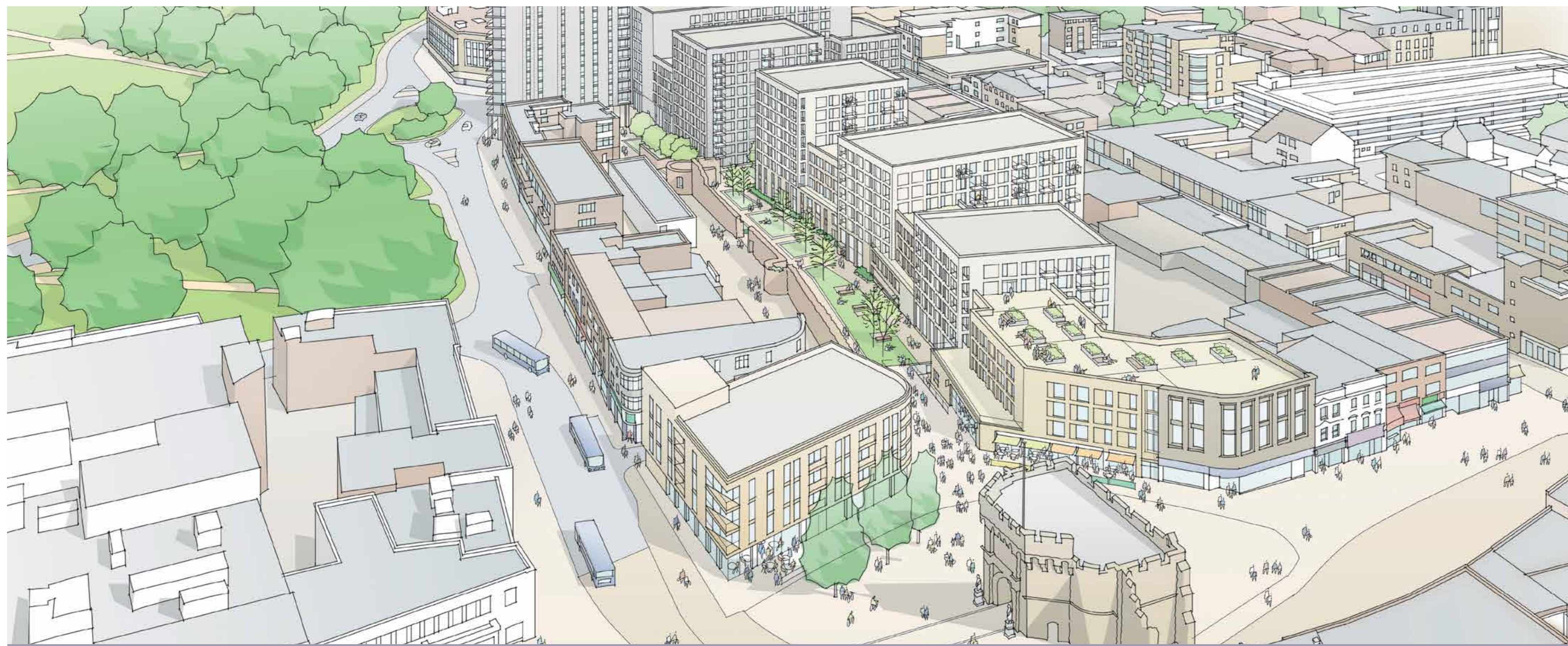
The Bargate Quarter viewed from the west of the site